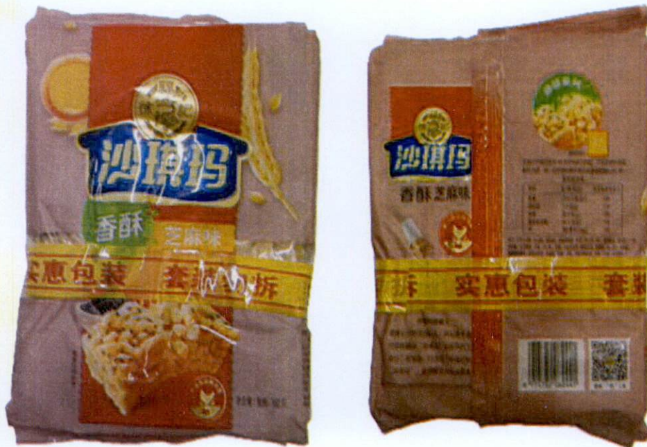
Figure 1. Unregistered BRAND NAME IN FOREIGN LANGUAGE Product Name in Foreign Language

The Food and Drug Administration (FDA) warns all healthcare professionals and the general public NOT TO PURCHASE AND CONSUME the unregistered food product: